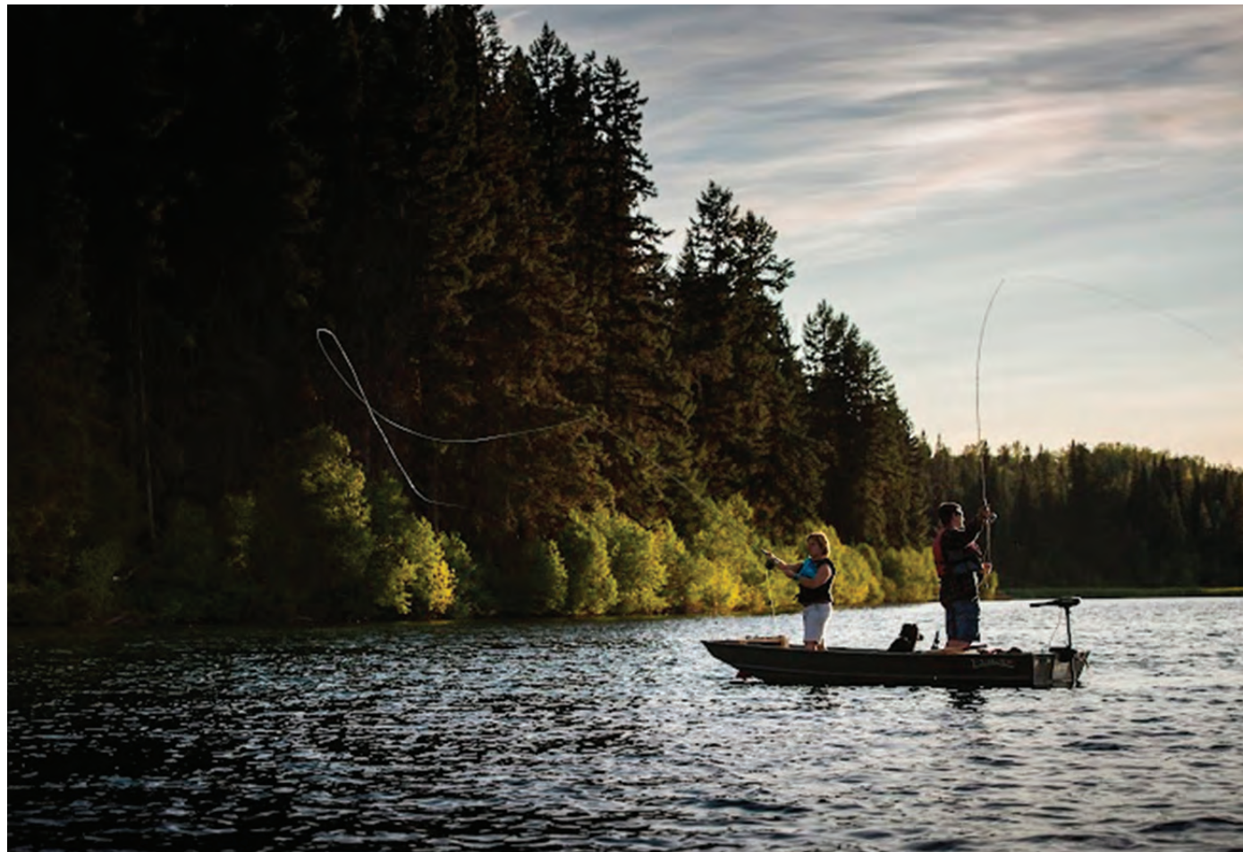
Fly-fishing from a boat at Fawn Lake Resort