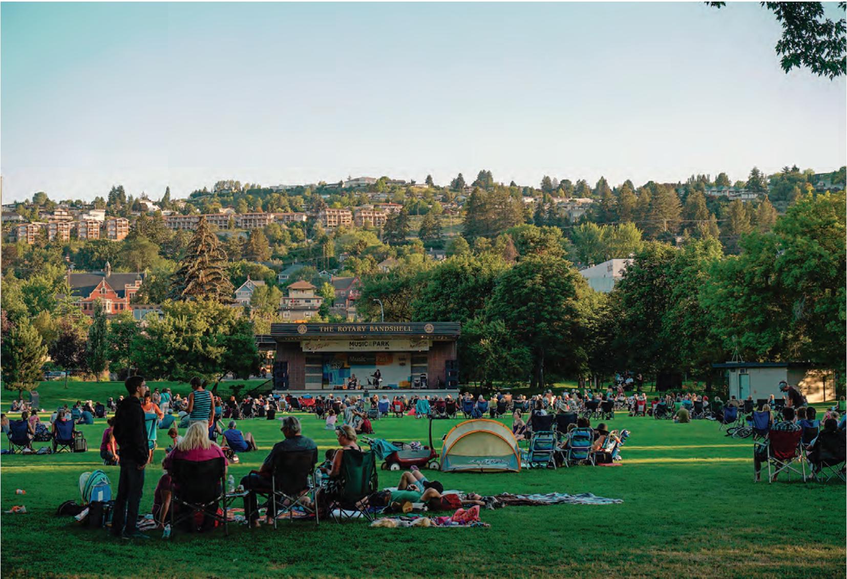
Kamloops Music in the Park BC Ale Trail